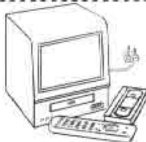
television and video