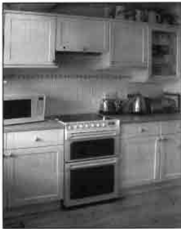
NOW in the kitchen