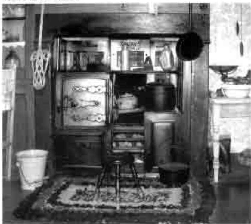
100-years ago in the kitchen